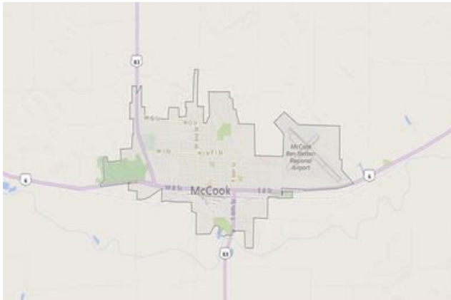
Figure P.1a (1) - 1 McCook, NE

The closest towns of larger size are to the north by 75 miles, North Platte, population 24,110 and to the northeast by 105 miles, Kearney, population 33,520.